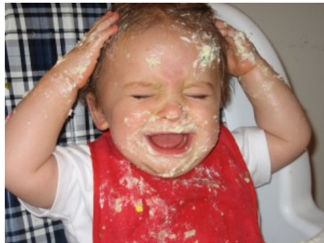
A not-so-perfect parenting moment

( http://blogs.forbes.com/carolinehoward/2011/01/14/chinese-mothers-vs-western-moms-new-mommy-war-in-the-corner-office/ ) Amy Chua ( http://blogs.forbes.com/carolinehoward/2011/01/20/tiger-moms-chinese-mothers-amy-chua-parenting-discipline/ )). Whatever the cause, their lives are hectic.